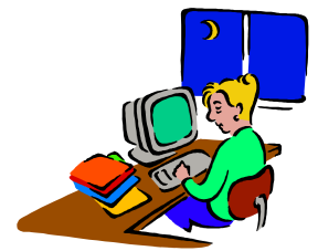
The E-Reserve system is up and running. Visit the KU Library homepage for access.

The E-Reserve system is the latest development in the library's ongoing mission to improve accessibility and convenience for our patrons. We try to be "user-centered" in our approach and welcome any input you may have regarding how we can better meet the needs of the KU Law students and faculty that make up our core constituency!