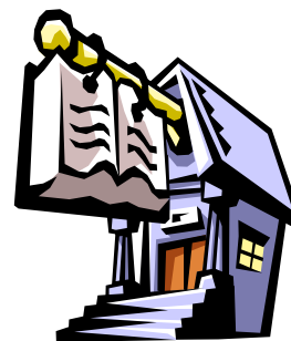
KU Law and Emporia State University collaborate to educate the law librarians of the future.