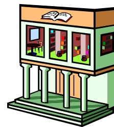
The Law Library sustained some minor damage from storms in early March.